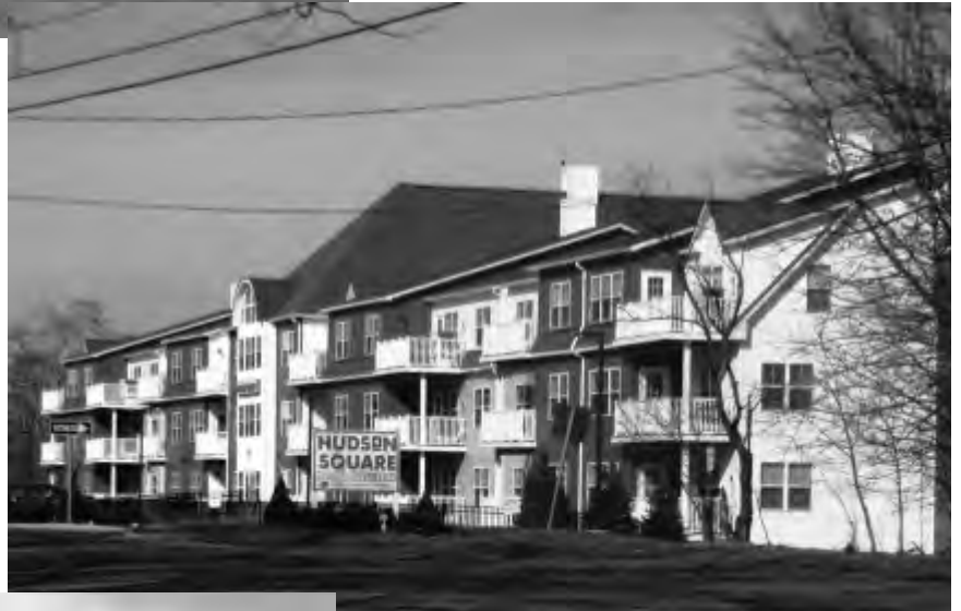
Hudson Square Apartment Complex East side of Van Schaick Pond to Delaware Avenue