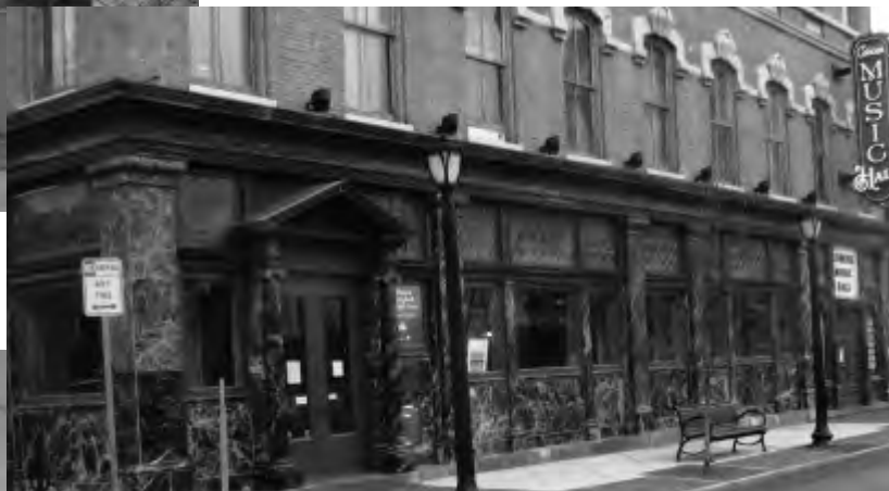
Cohoes Music Hall New Sign & New Management. Check it out

Some are new, some revamped. Take a ride around town and check these out. There's a lot of construction going on.