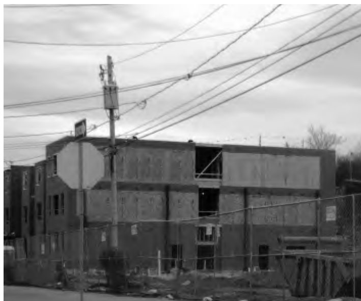
West side of Sargeant Street between Ontario & White