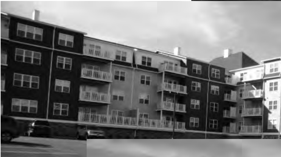
Hudson Square building # 2 from Delaware Avenue looking west