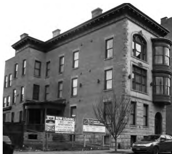
The Cohoes Hotel Renovated inside and out. Rooms available