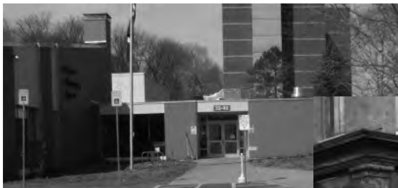
Cohoes Community Center "We miss our pool and gym"