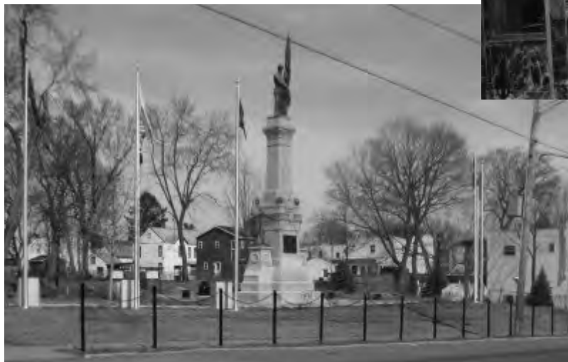
Veterans Park & WWII Monument Columbia Street