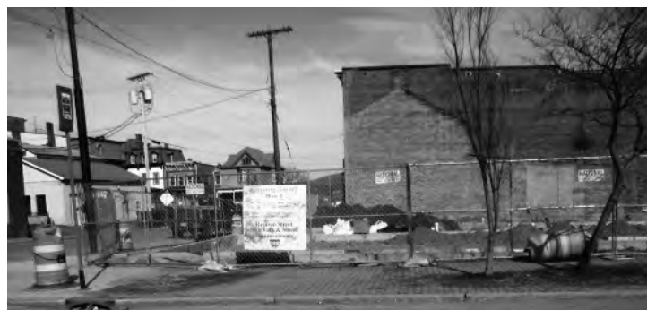
Cohoes Theater lot. Construction has begun on retail spaces with parking