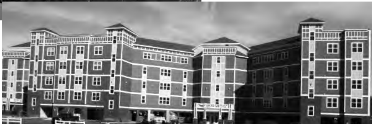
Admiral's Lookout overlooks the Hudson River