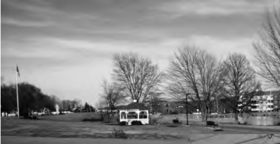
Van Schaick Island Veteran's Park & pond area & Gazebo