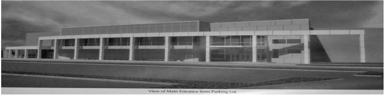
View of Main Entrance from Parking Lot